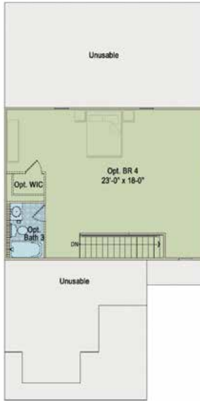
3RD FLOOR W/ OPTIONAL BEDROOM 4/BATHROOM 3 ~2,554 SQUARE FEET