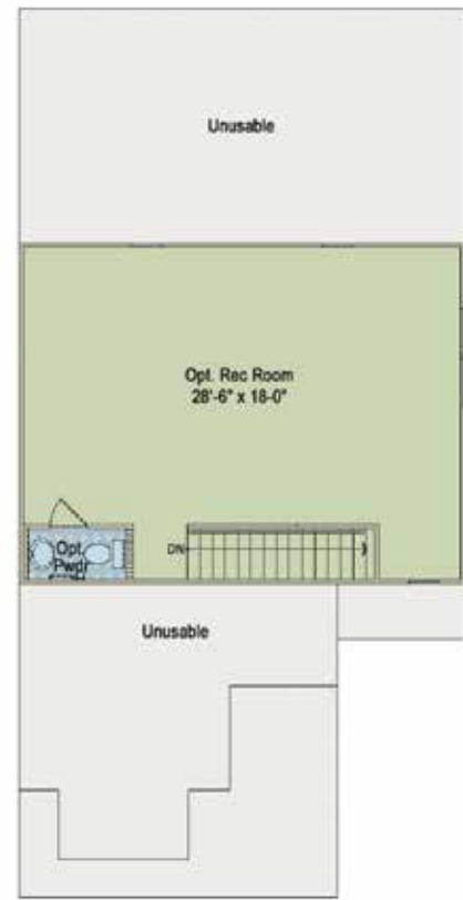
3RD FLOOR W/ OPTIONAL REC ROOM ~2,554 SQUARE FEET