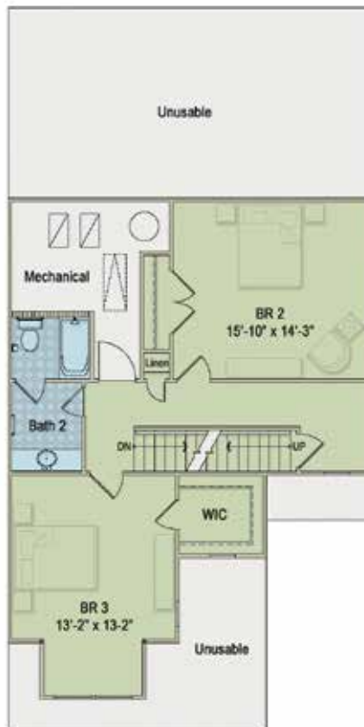
2ND FLOOR W/ OPTIONAL 3RD FLOOR STAIRS ~1,924 SQUARE FEET