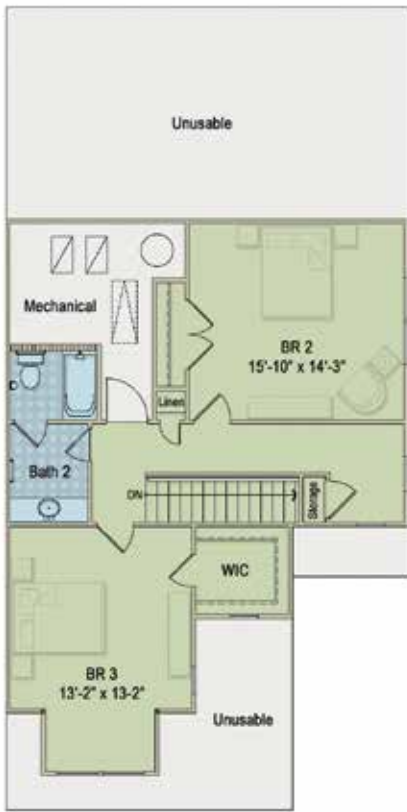
STANDARD 2ND FLOOR ~1,924 SQUARE FEET