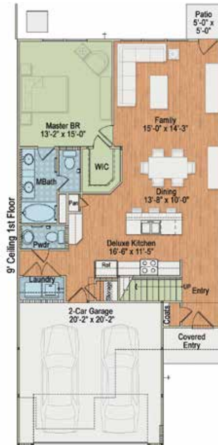
STANDARD 1ST FLOOR ~1,924 SQUARE FEET