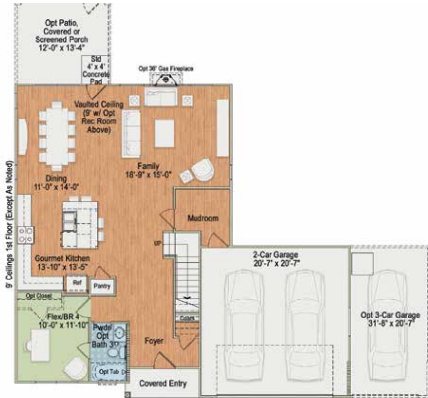
FIRST FLOOR W/ EXTENDED REC ROOM ~2,772 SQUARE FEET