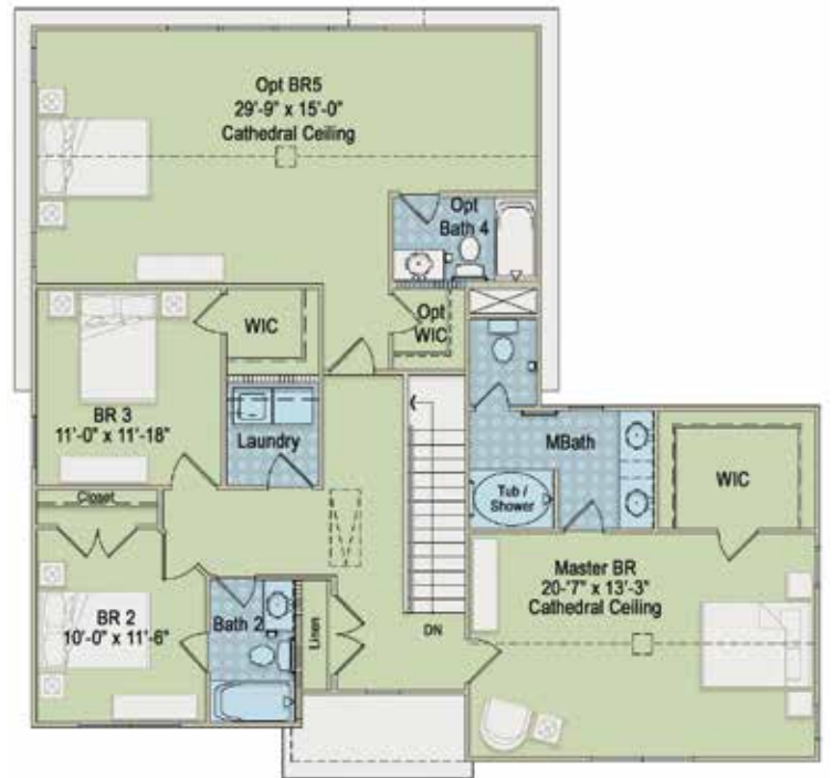
W/ OPTIONAL BEDROOM #5 ~2,772 SQUARE FEET