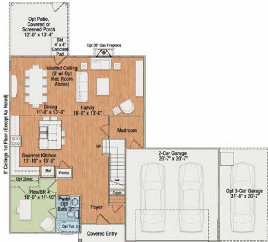
BASE FIRST FLOOR ~2,265 SQUARE FEET