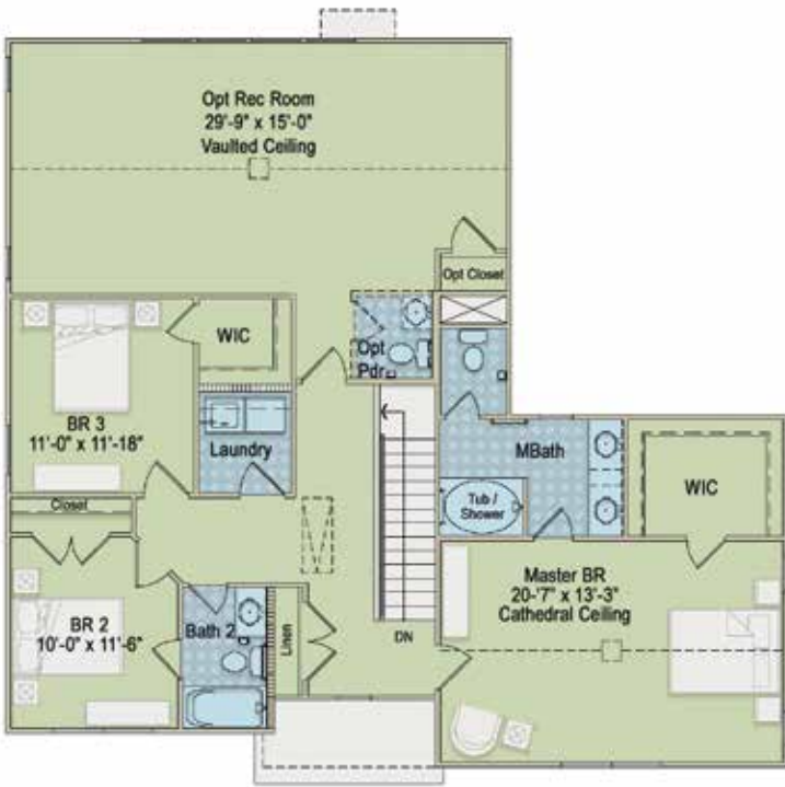
W/ OPTIONAL REC ROOM ~2,772 SQUARE FEET